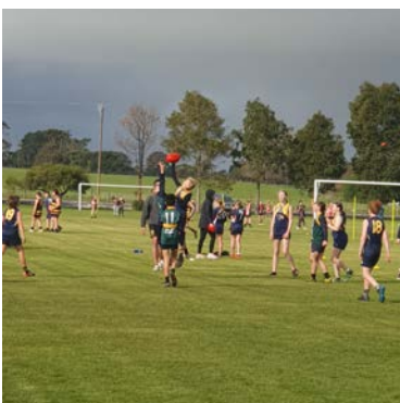
The School team in action