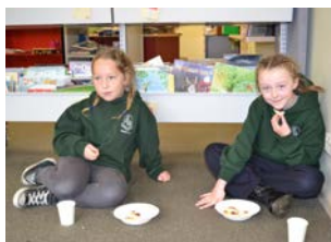
Indigenous Food Tasting

The Year 7-9 Pathways class hand made "Star Children", which are linked to the Dreaming Story of Indigenous People of Tasmania. "Dreaming" is the word used to explain how life came to be; the stories and beliefs behind creation. Dreaming is the past and also the present and the future, and is constantly evolving to explain events and changes today, such as floods, storms and occurrences in people's lives.