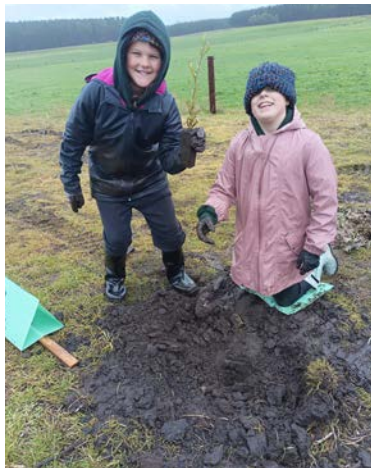
Students with a seedling, pre-planting