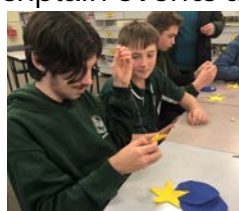
"Star Children" construction

For more NAIDOC week images, please see the Newsletter insert.