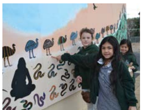
School Collaborative Artwork

Class story time and food tasting were the focus for Day 2; the Foundation class were entertained with "Why I Love Australia", the Year 1-2 class selected the "Bold Australian Girl" and the Year 3 Class enjoyed "Caring for Country". During each story time session, each class had the opportunity to experience Indigenous food tasting, with the sample plate selection including lemon myrtle cookies and scones with karkalla relish and the following jams: green ant, bush apple, finger lime, muntries and lemon myrtle and wild rosella.