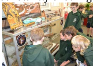
Indigenous Artefact Display