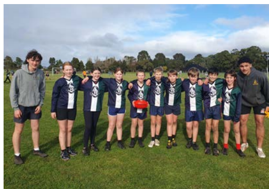
The Allendale 9-a Side Mixed Football Team