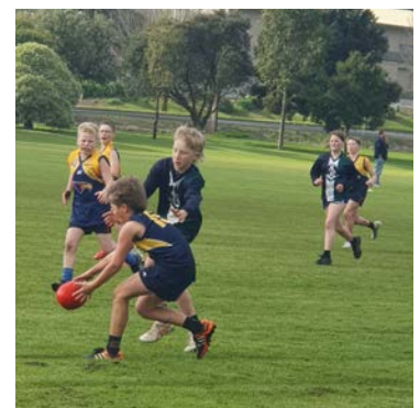
...and some further action